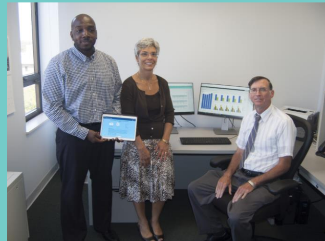
TSSR Project Staff at ITSMR

“This database enables both the public and traffic safety professionals to quickly find statistical data about crashes and traffic tickets.”